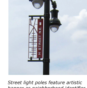
banner as neighborhood identifier.