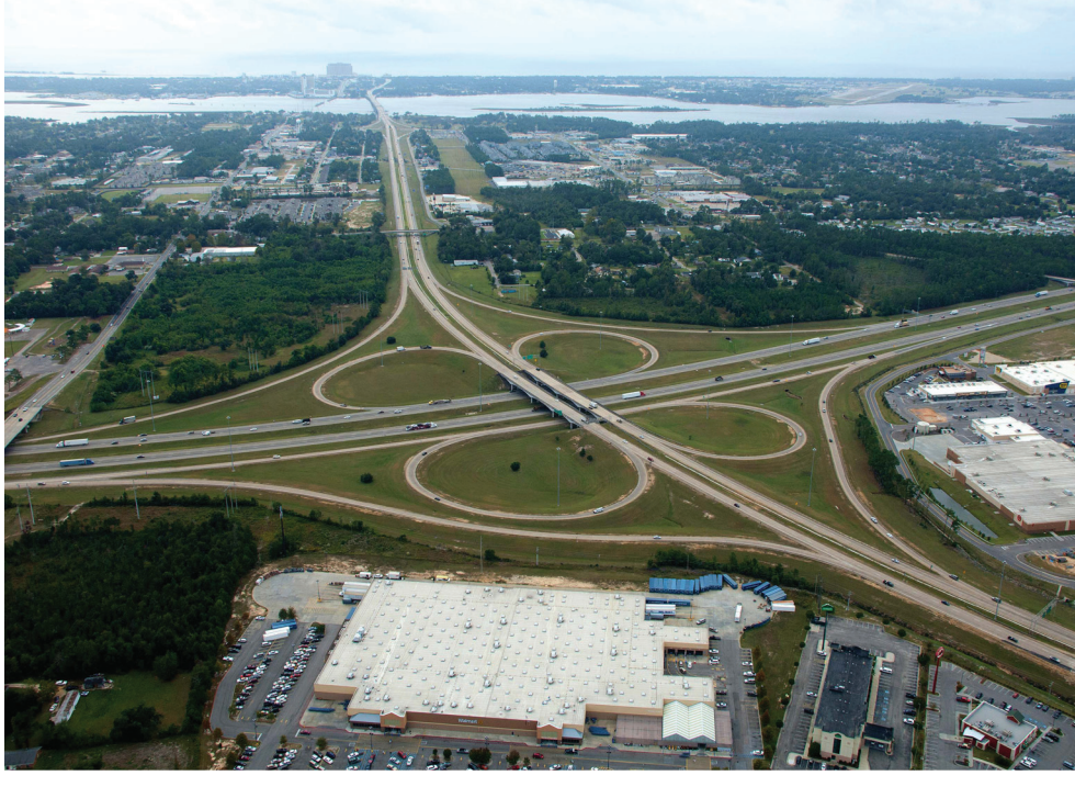
I-10/I-110 Interchange in D'Iberville, MS